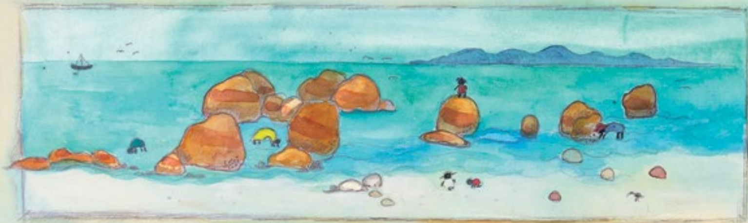
shell collecting on the beach

Aunties all around. Collecting shells, stringing them into necklaces. Uncles all around.